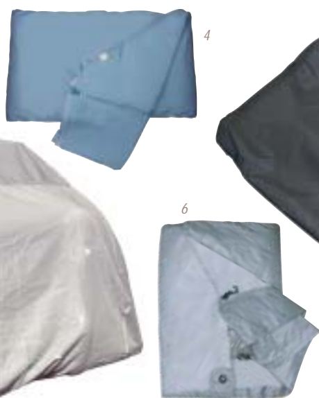
Premium tailored indoor covers

This is the top end of the spectrum for interior covers. This flannel cover features double-stitched seams, neoprene elastic sewn in the front and rear bases and scratch proof grommets for locking (use our cable and lock, part no. GAC2022X) or tying down your cover. This cover has a body specific fit and comes with a 2 year warranty.